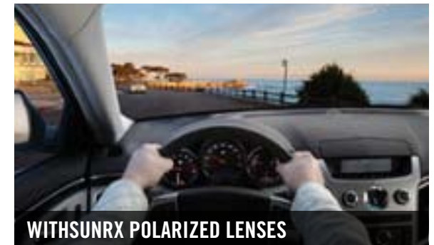
WITH SUNRX POLARIZED LENSES