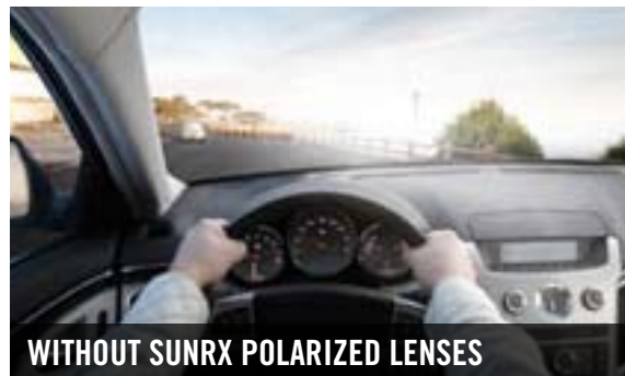
WITHOUT SUNRX POLARIZED LENSES

Industry-leading polarizing technology eliminates 99% of reflected glare and provides improved comfort for all outdoor activities.